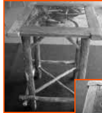
Pictured Left: Rosemary Mellette has created a one-of-a-kind lodge table that will be auctioned off at the banquet.