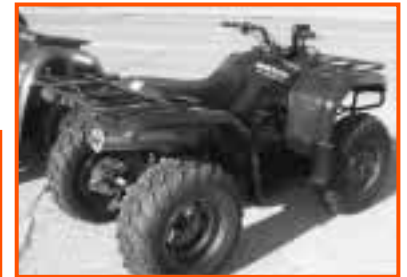
Roll all 6's and you could have a chance of winning an ATV!