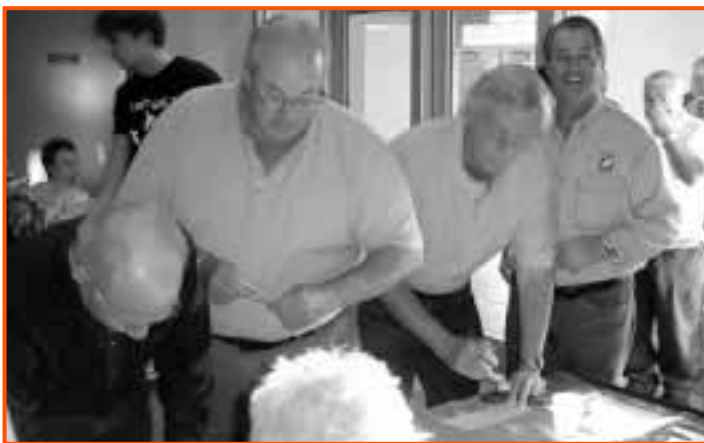
The good times begin as everyone walks through the doors of the World's Only Corn Palace for the Banquet on October 20th!

The form to purchase tickets and chances at the Big Gun can be found on the back of this brochure as well as the Pheasant Country website www.pheasantcountry.org .