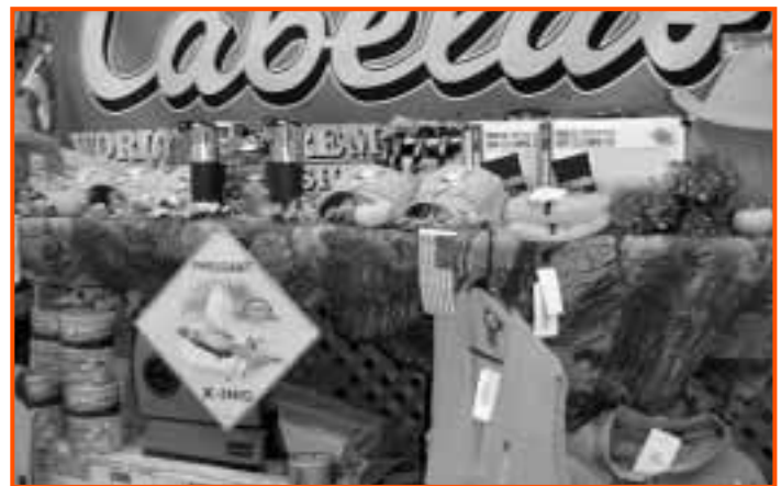
Again this year there will be something in the raffle to appeal to everyone.