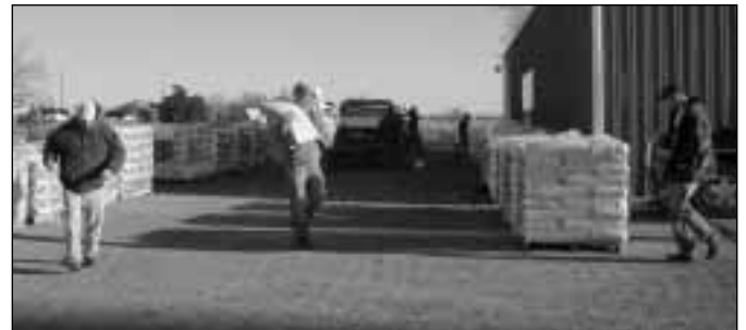
Photo of PCL Volunteers Passing out Seed in April at Big Green Fertilizer Company – Pheasant Country Landowners/Contract Holders all have the opportunity to receive seed on a first-come, first-serve basis