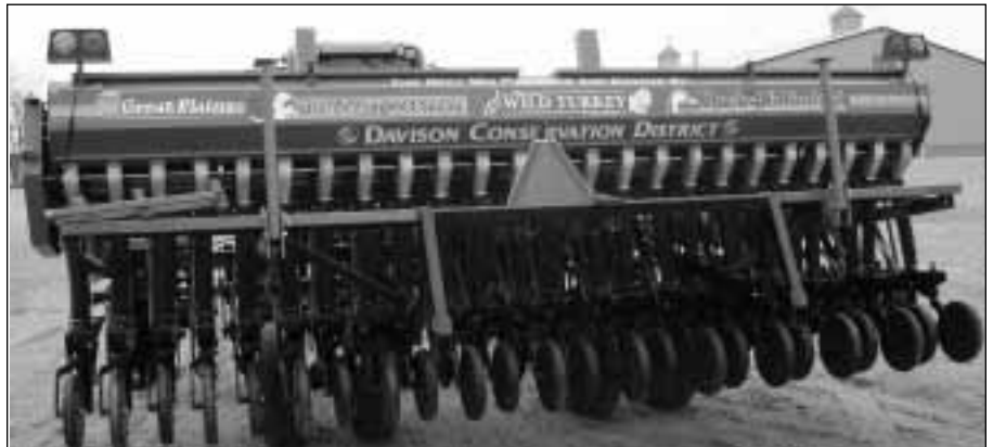
Davison County Conservation District's new Great Plains no-till grass drill. The new drill cost close to $50,000 with funds coming from area sportmen's groups - 3/4 funding from Pheasant Country, 1/8th from Ducks Unlimited and 1/8th from the National Turkey Federation.

The season runs October 20 through January 6. Daily limit is 3 cock pheasants, with a possession limit of no more than 15 cock birds. Shooting hours are noon central daylight time to sunset, October 20-26, and 10 a.m. central standard time to sunset for the rest of the season. Review the Hunting Handbook for proper identification to be left on birds and other legalities. Which is available at www.sdgifp.info as well as at license agents.